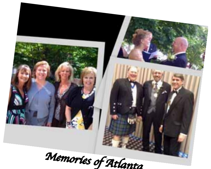
Memories of Atlanta