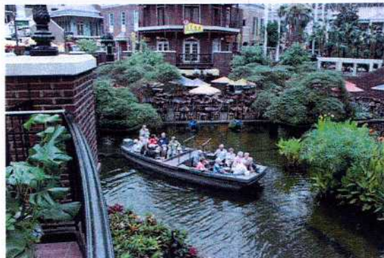
Yes, you can ride a riverboat INSIDE the Opryland Hotel!

----- SEPTEMBER 14-16, 2011 TAMCAR FALL INSTITUTE & ACADEMY MURFREESBORO EMBASSY SUITES MURFREESBORO, TN